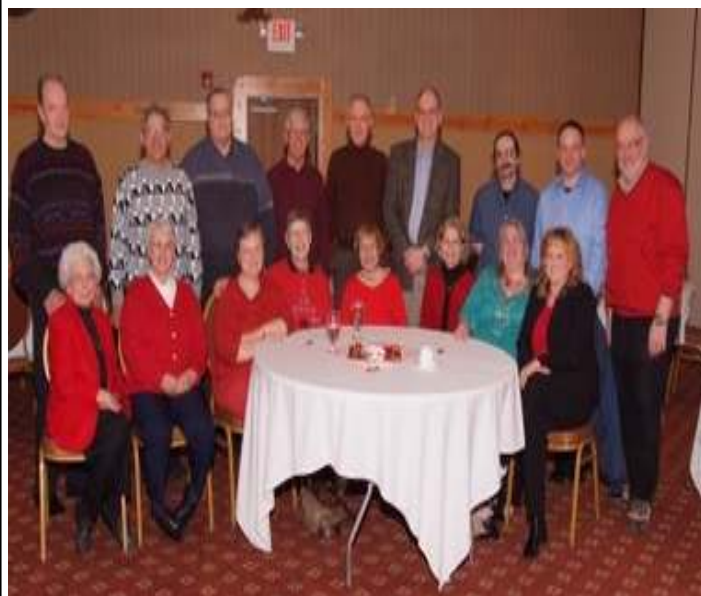
2009 CVARC Valentines Party

Trivia answer: An Organization of CW enthusiasts